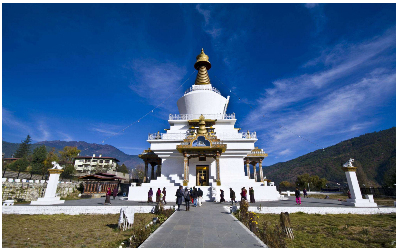
The Thimphu Memorial Chorten, built in memory of His Majesty Jigme Dorji Wangchuck, the Third King of Bhutan

The Thimphu Memorial Chorten is one of the most revered and visited religious landmarks in the Bhutanese capital. Completed in 1974 and built-in memory of His Majesty Jigme Dorji Wangchuck — the Third Druk Gyalpo, widely regarded as the Father of Modern Bhutan — the chorten serves both as a memorial and an active place of worship that remains central to the spiritual life of Thimphu's residents.