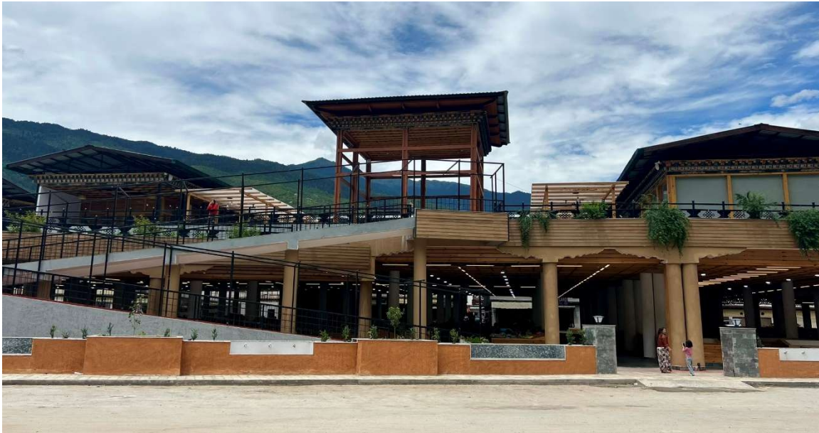
The Centenary Farmers' Market and Craft Bazaar — Thimphu's vibrant hub for local produce, handicrafts, and cultural shopping

The Centenary Farmers' Market is Thimphu's most vibrant and colorful marketplace, located on the banks of the Wang Chhu river. Open to the public, the market is a sensory feast of fresh local produce, traditional foodstuffs, medicinal herbs, and everyday Bhutanese goods.