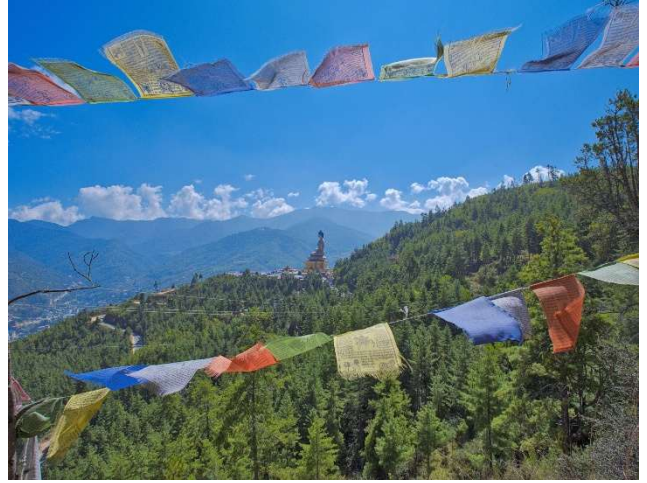
The magnificent Buddha Dordenma statue at Kuenselphodrang, overlooking Thimphu Valley

Kuenselphodrang, popularly known as Buddha Point, stands as one of the most iconic landmarks in Bhutan. Situated on a commanding hilltop overlooking the entire Thimphu Valley, the site is home to the magnificent Buddha Dordenma — one of the largest Buddha statues in the world. Rising to a height of approximately 169 feet (51.5 metres) and crafted from bronze and gilded in gold, the statue is an awe-inspiring testament to Bhutan's spiritual devotion and artistic mastery.